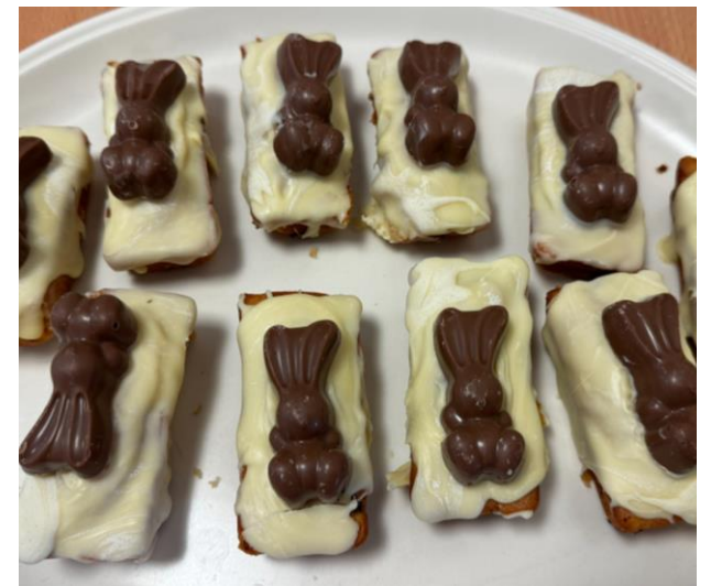
Imogen (year 6)