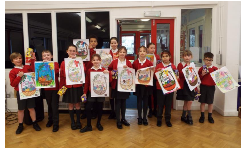
Our 12 runners up