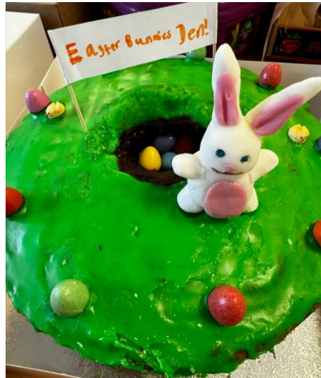
Freddie (year 5)