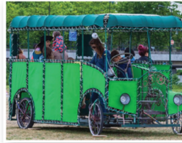
Aylesbury Garden Town's Bicycle Bus!

One winner will receive a new bike from Otec Bikes and three runners-up will receive £50 of cycling vouchers each. The four chosen pictures will also decorate the Aylesbury Garden Town Bicycle Bus in this year's WhizzFizzFest Parade!