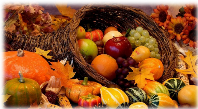
St Mary's Church, Church Lane, Wendover

Please join us for this family friendly service