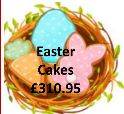
Easter Cakes £310.95

We can't wait for more fantastic events ahead — watch this space!