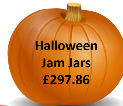
Halloween Jam Jars £297.86