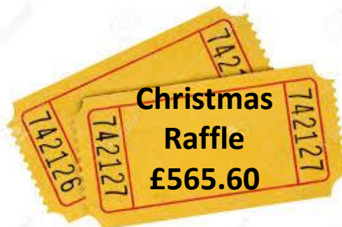
Christmas Raffle £565.60