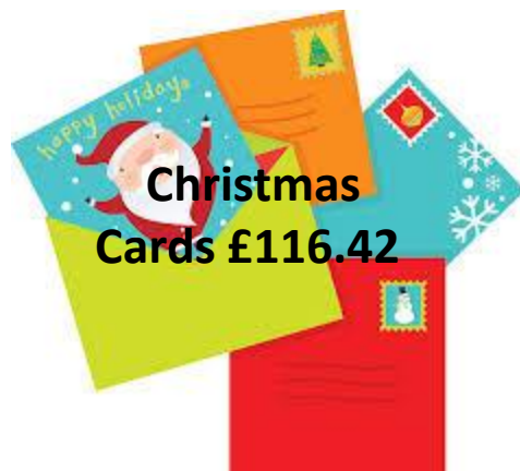
Christmas Cards £116.42