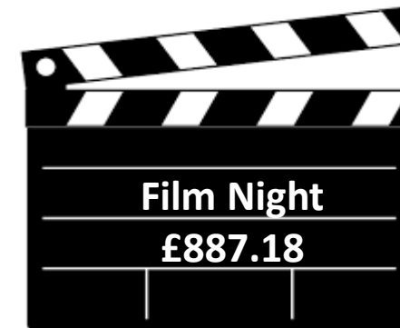
Film Night £887.18