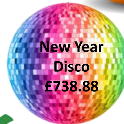
New Year Disco £738.88