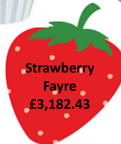
Strawberry Fayre £3,182.43