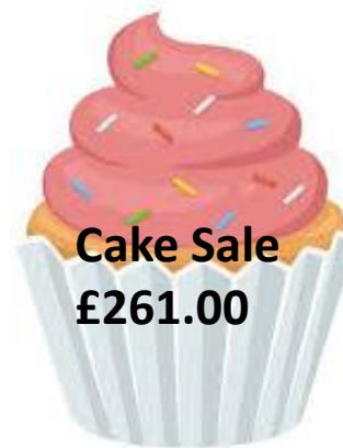
Cake Sale £261.00